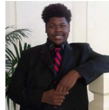
Coastal Lt. Governor, Geoffrey Whitley (Schools: East Carolina, UNC-Pembroke)