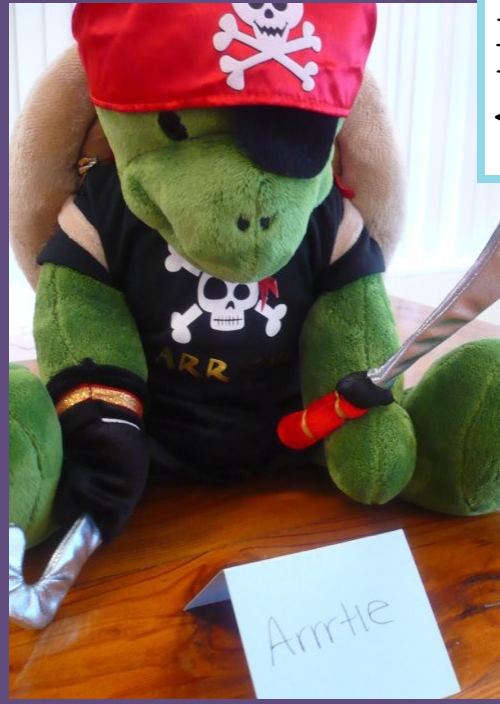
DISTRICT MASCOT, <<Artie