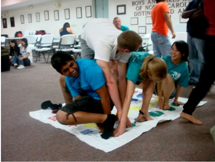
Circle K'ers playing Twister at DLSSP 2010 at the Boys and Girls Homes of Lake Waccamaw, NC.