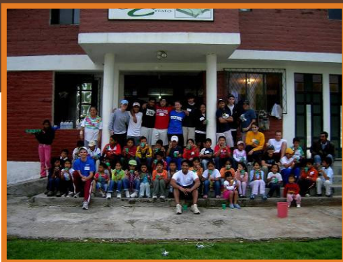
Duke University in Latin America (See Tomorrow Fund article, pg.7)

The mission of Circle K International is to involve college and university students in campus and community service while developing quality leaders and citizens. Circle K inspires people to better our world.