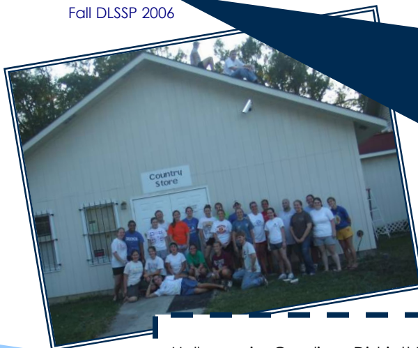
Fall DLSSP 2006